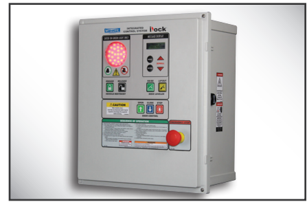
Optional iDock® Controls offer enhanced operation and an interactive message display with equipment information.