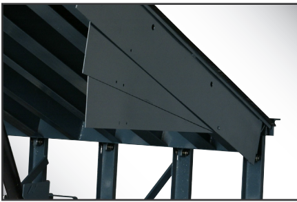
Full range sliding style toe guards for added safety.